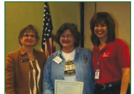
Thelma Rose Rogers ISD